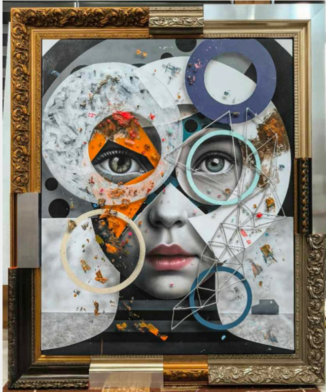
WINTER IS COMING

ACRYLIC ON CANVAS ON CUSTOMIZED FRAME 182.88 X 152.4 CM 2024