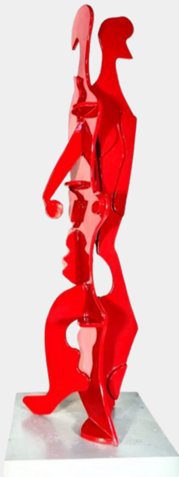
SENTINEL # 21

METAL AND COLOR Height : 5ft 4 inches Width : 18 inches 2024