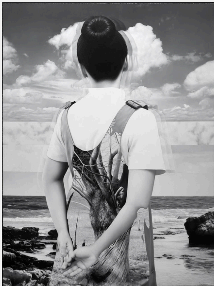
ONE WITH NATURE