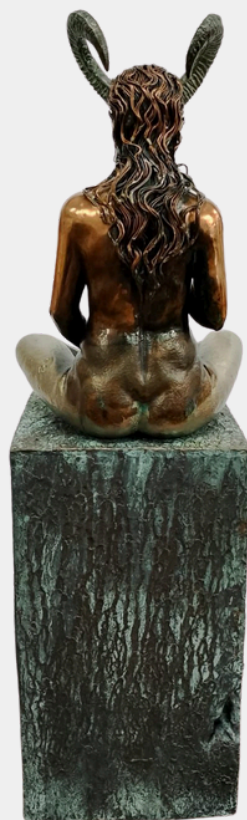
LAKAPATI "GODDESS OF FERTILITY AND AGRICULTURE"