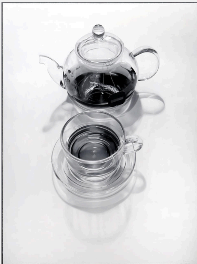
MY DAY WITH MY TEA