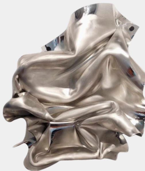
RENARD ARGENTE (SILVER FOX)