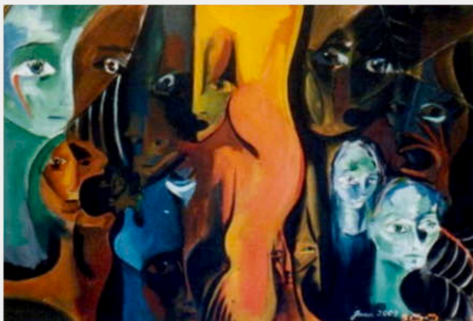
NOISELESS PATIENT SPIDER 2